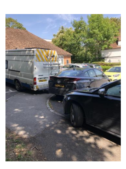
Cars parking obstructing pavements outside the vets during lockdown (July 2020)