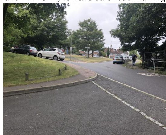
Cars parking close to corners of west side forks during lock down (July 2020)