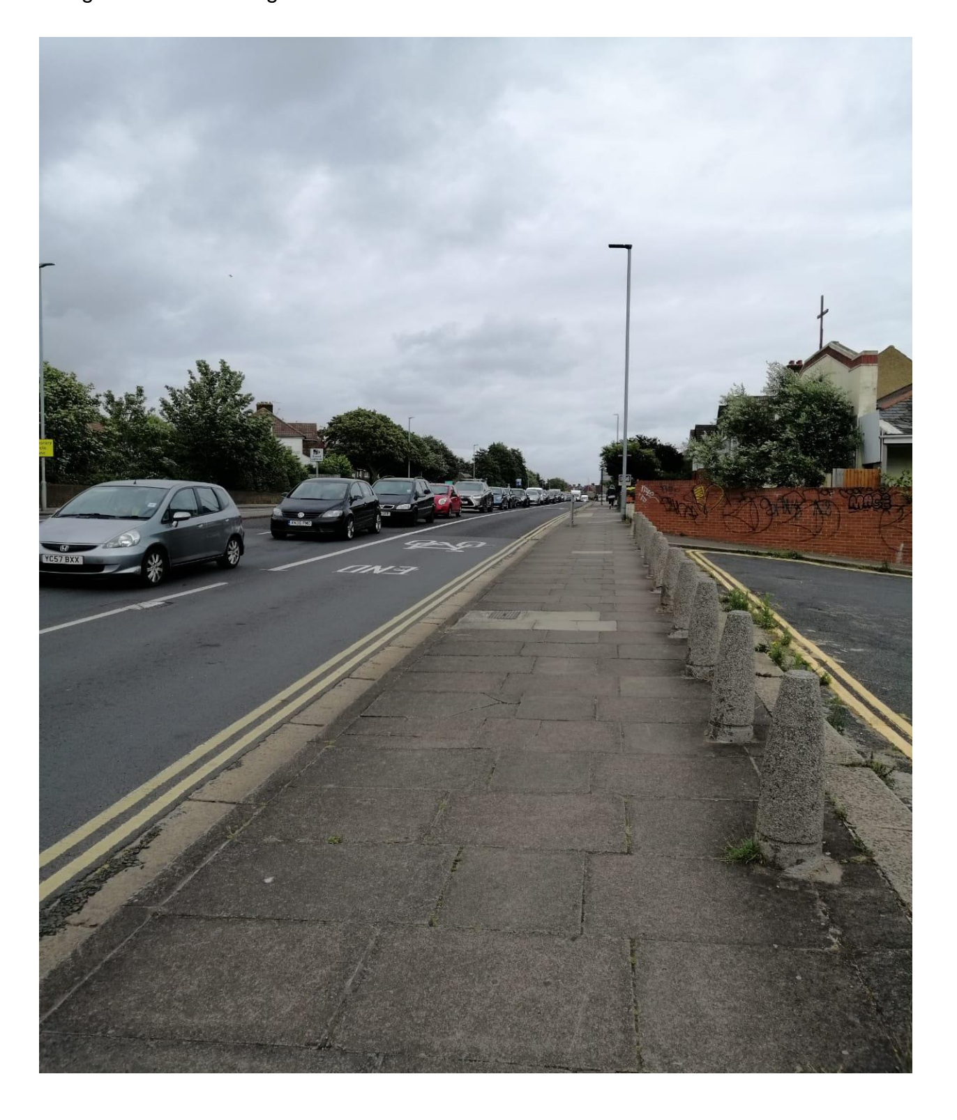
Images 1 & 2: Cars at the Boundary Road junction along Old Shoreham Road with queues stretching as far as the eye can see, beyond Olive Road. With cars not permitted to use the second road lane to their left, this queue includes cars intending to go both left and straight over after the lights.

Since its implementation, use of this temporary cycle lane has been minimal by cyclists whilst use by vehicles remains heavy and consistent, as is to be expected on a dual carriageway that is used to cover the longer distances between numerous towns and the city of Brighton.